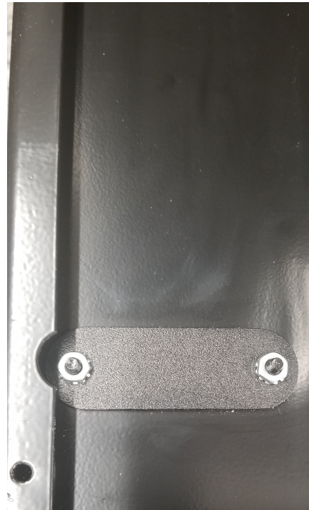
Metal plate that can be removed to add second padlock bar