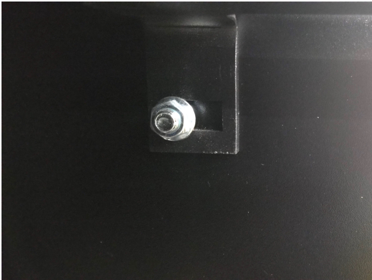
Adjustment to make padlock tighter to the door

Any machines that have the vertical padlock bar will not have a punch out or plate for the second padlock bar. In the near future, we will have a solution available for purchase. Future machine purchases will come with the second padlock bar. Please call technical support for purchases or questions: 570-244-3123.