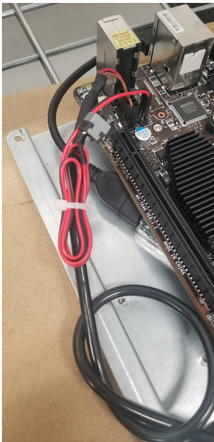
Pictured: The reset button

The last big change is the reset button on the board. On the old MSI and ASROCK boards, you had to jump a series of 9 pins to reset the board. Normally, this was necessary when the fan would not start due to the BIOS settings. Now, instead of jumping the pins on the A3201, there is now a button that comes off the board. Press the button to jump the pins. Below are a few pictures to illustrate the new changes: