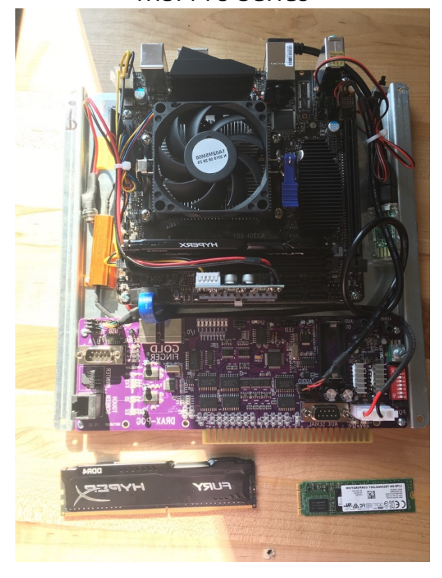
MSI Pro Series

The MSI Pro Series motherboard uses DDR4 RAM and comes with a Plextor hard drive. The hard drives on these boards are mounted on the back of the board.